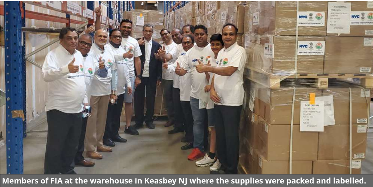
Members of FIA at the warehouse in Keasbey NJ where the supplies were packed and labelled.

Federation of Indian Associations NY-NJ-CT. 501(C)3. The Largest Non-Profit Grassroot Umbrella Organization in the Tri-state of NY-NJ-CT