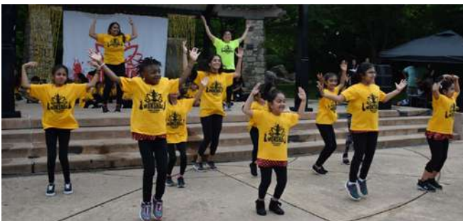
Mokshaa students in action

There were a total of 16 performances, including two finales and a flash mob dance by the parents.