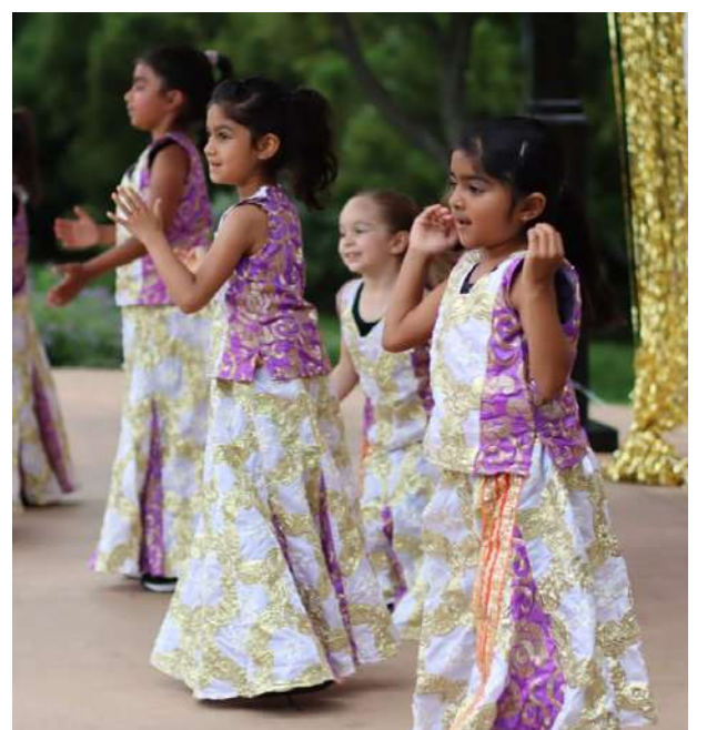
The youngest dancers performing