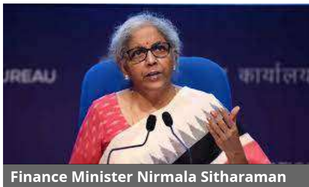
Finance Minister Nirmala Sitharaman

The travel and tourism sector has suffered huge losses across the world, thanks to the Covid-19 pandemic and the resulting lockdown everywhere. Even when the travel restrictions were removed after the first wave, many were reluctant to travel for fear of contracting the virus.