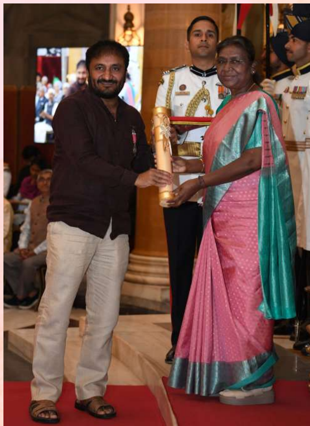
President Droupadi Murmu presents Padma Shri to Anand Kumar