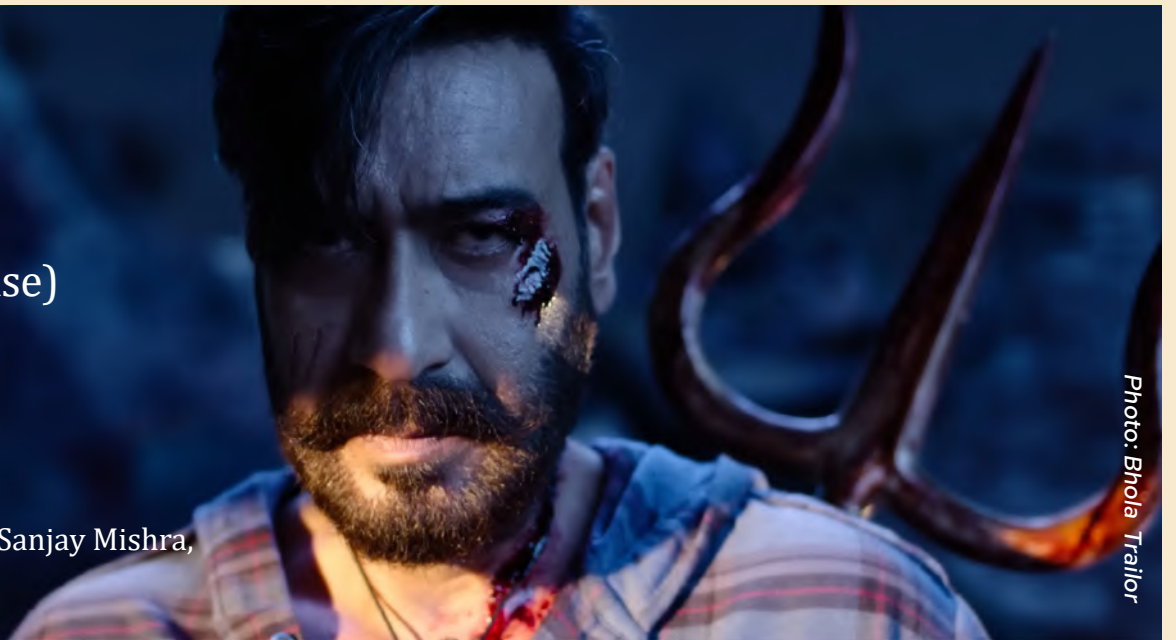
Photo: Bholaa Trailor