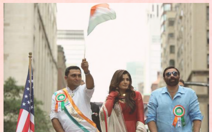
Raveena Tandon led the FIA India Day Parade in New York