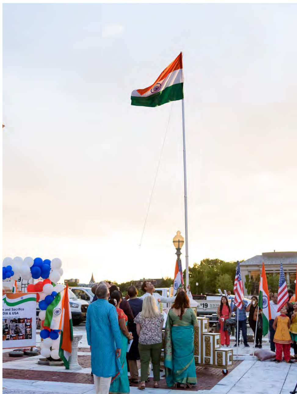
Flag Hoisting at Rhode Island State House