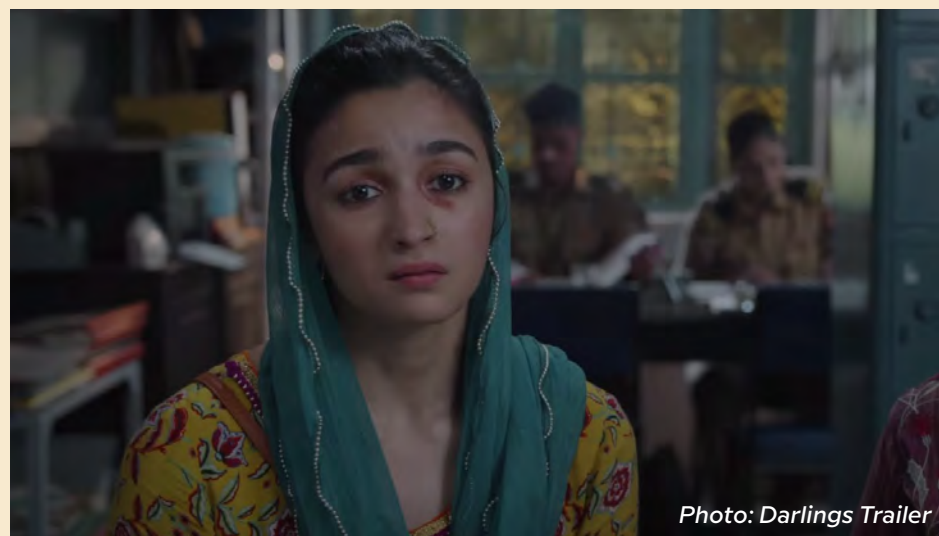
Photo: Darlings Trailer

The film might not appeal to all. I loved it. I would suggest watching it to know which side you are on.