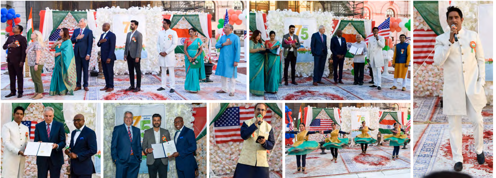
Indian cricket player Mr. R. P. Singh and several politicians from Massachusetts and New England at the Flag Hoisting ceremony

innovation and knowledge. For that to happen, it is important to increase awareness about numerous aspects of Indian heritage and culture in our younger generations and inspire the young budding minds to absorb the values embedded in them."