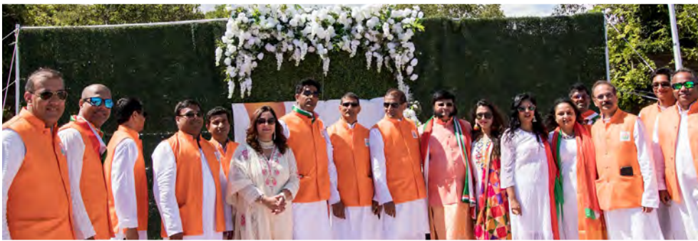
FIA New England committee members at the India Day Parade