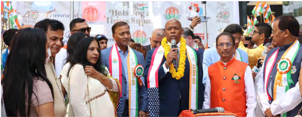
Mayor of New York City Hon. Eric Adams addressing the gathering at the Flag Hoisting ceremony