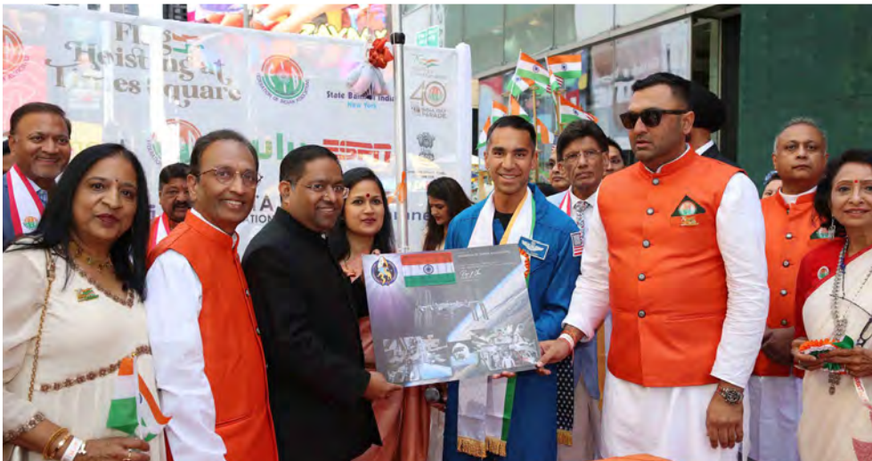
NASA Astronaut Mr. Raja Chari at the Flag Hoisting ceremony