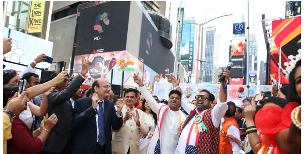
Devi Sri Prasad and singer Shankar Mahadevan at the Flag Hoisting ceremony