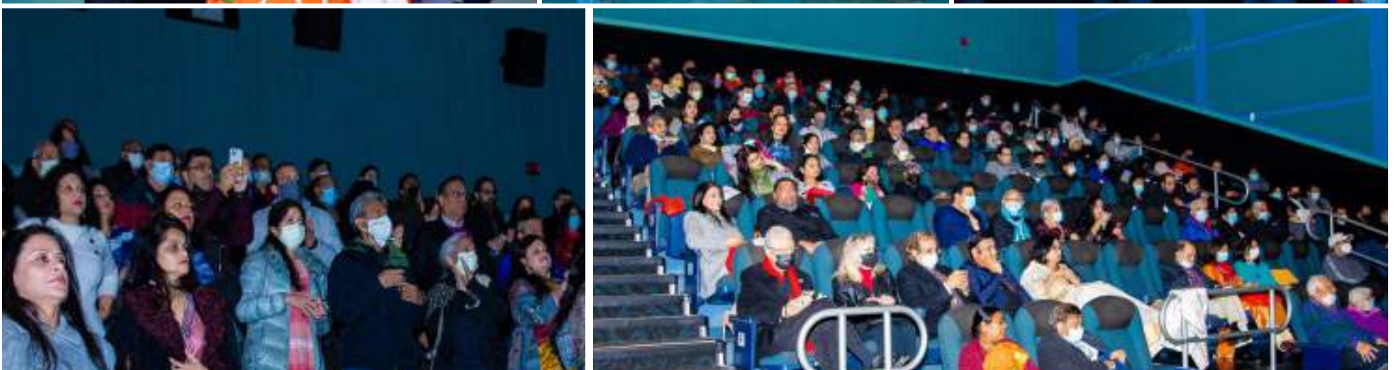
Several members of the Indian American community had gathered for the Pre-Release Screening of "The Kashmir Files"