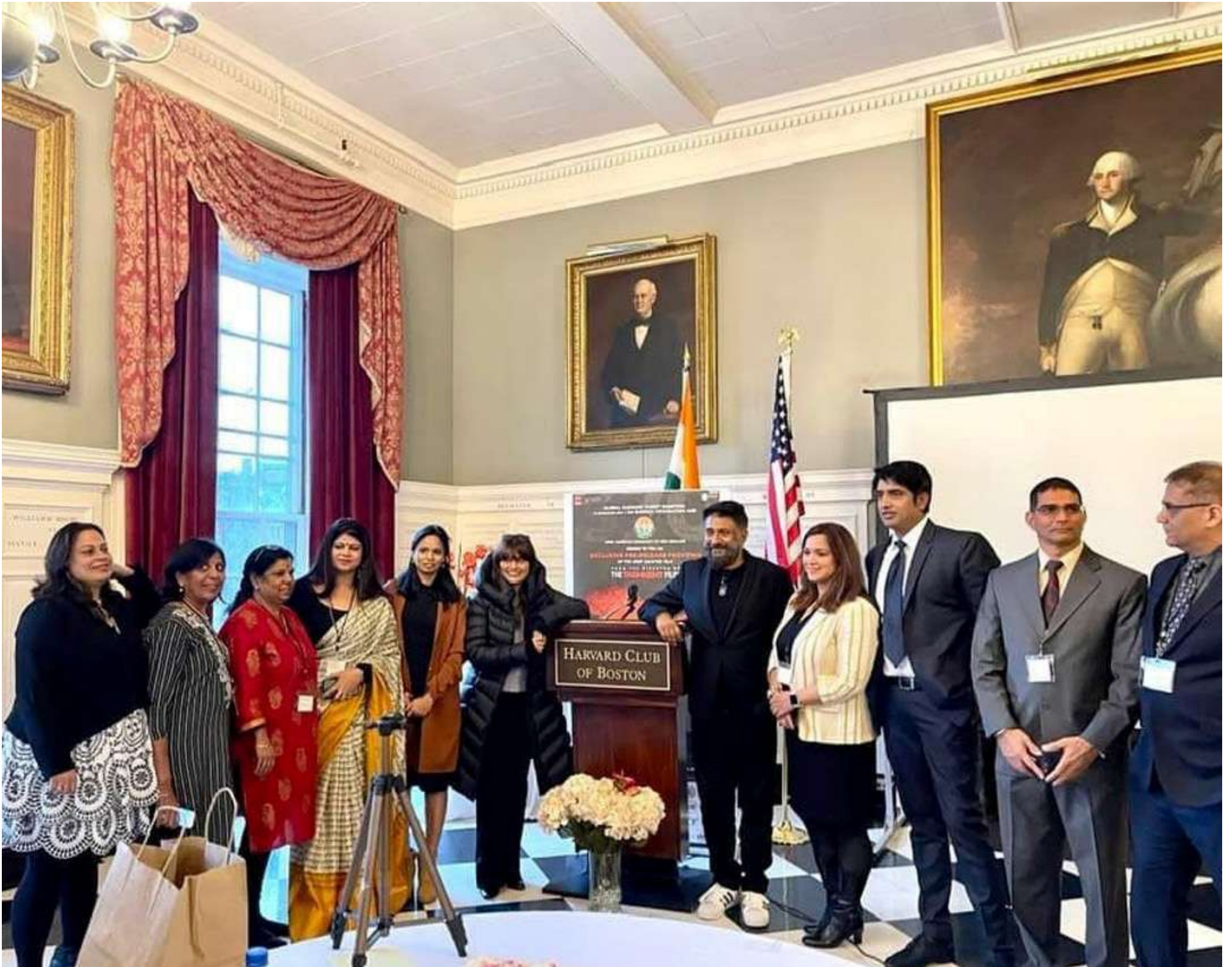
Vivek Agnihotri and Pallavi Joshi with team FIA, New England.

F ederation of Indian Associations (FIA) and Indo American Community with many other partner organizations arranged a free sneak preview of "The Kashmir Files (TKF)" film screening before the formal release of this film on January 26, 2022, that coincides with the Republic Day of India at the Regal Cinema, Marlborough, MA on the evening of Friday, December 10, 2021. They also organized two