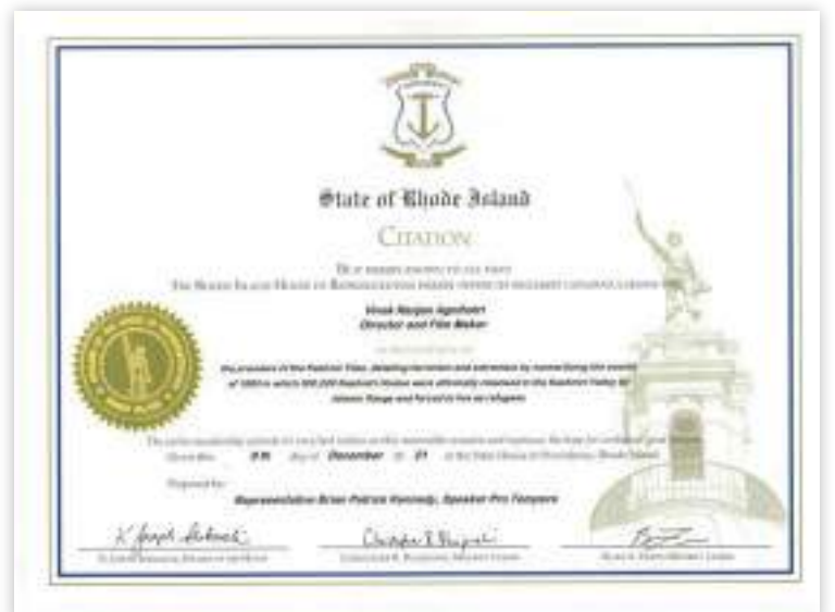
Rhode Island's Governor as well as that state's House of Representatives issued Citations.