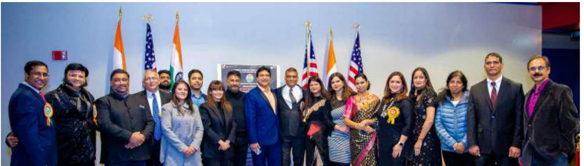
Indian- American Community with Vivek Agnihotri and Pallavi Joshi