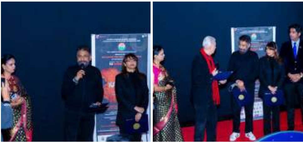
Citations were issued to Mr. Vivek Agnihotri and Mrs. Pallavi Joshi for a pre-release screening of their upcoming movie "Kashmir Files"

The husband-and-wife team also talked about the movie and its impact on terrorism in an exclusive video interview on Chai With Manju. During the interview, they talked about the years of research that went into making this movie.