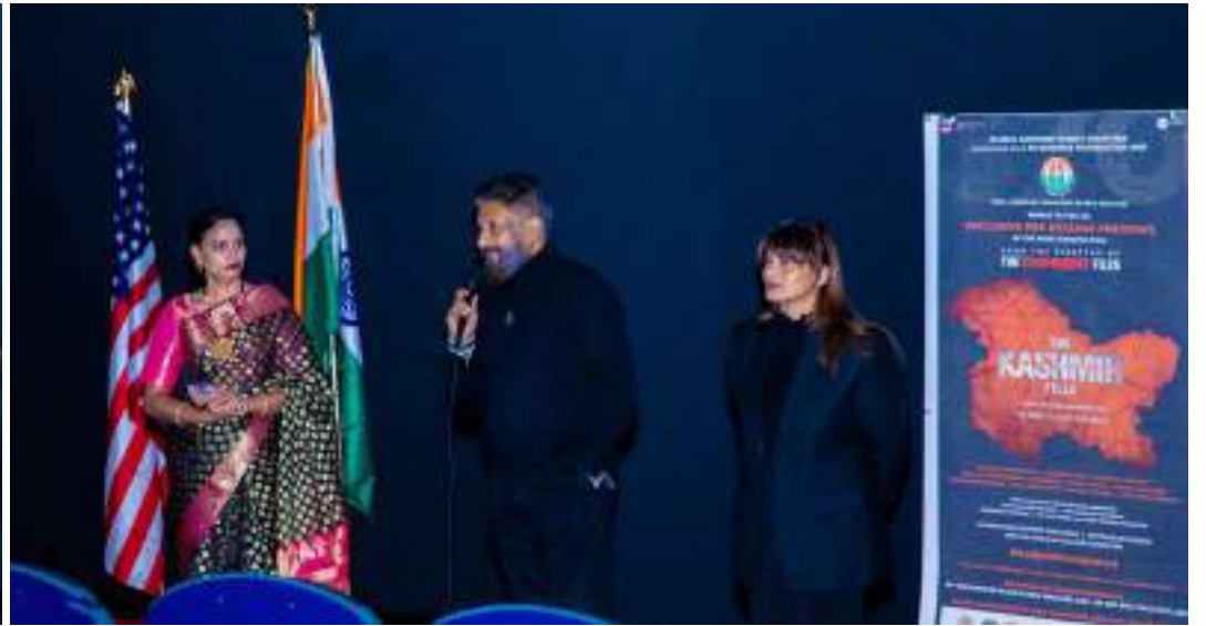
Mr. Vivek Agnihotri addressing the gathering