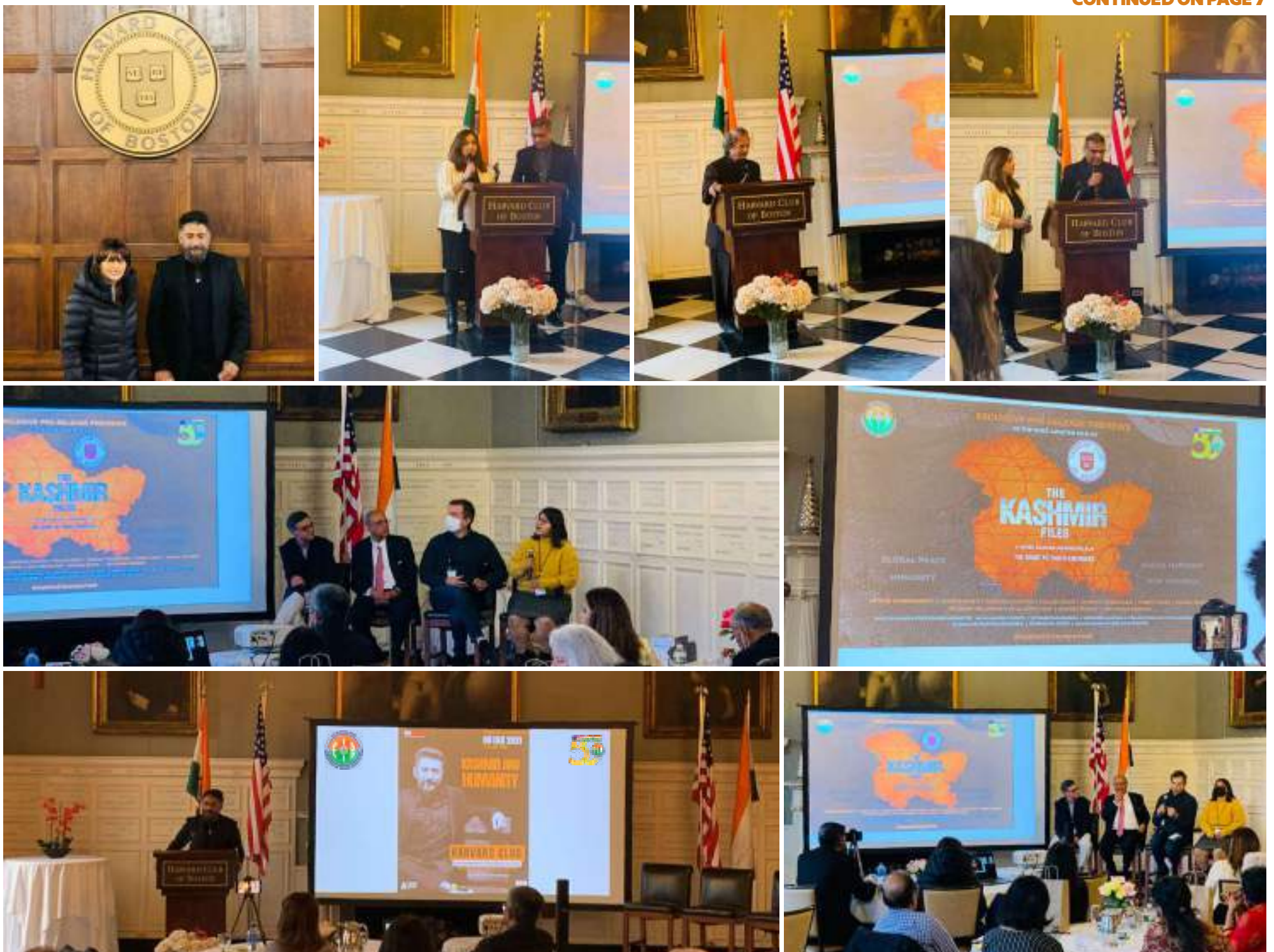
Exclusive pre-release film Impact programs about 'The Kashmir Files' on Wednesday, December 08, 2021, at Harvard Club, Boston.