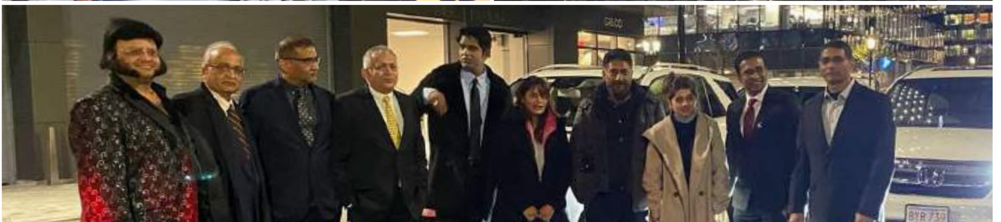
A warm welcome of the director and producer