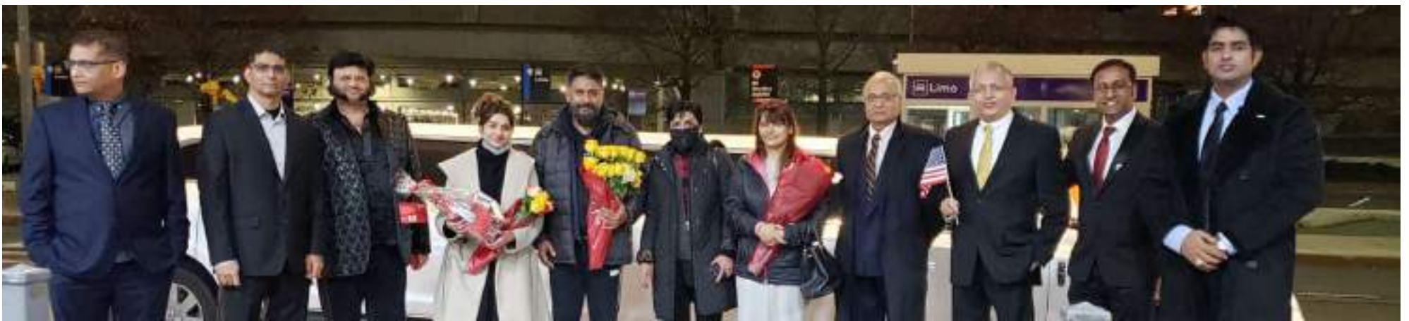
FIA -NE team welcoming Vivek Agnihotri and Pallavi Joshi.