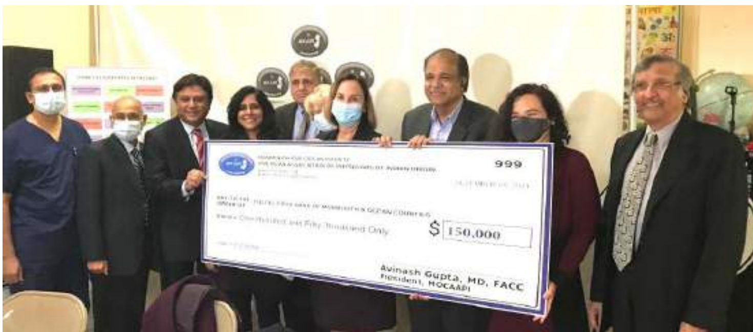
MOCAAPI donated to a food bank and an Indian Cultural Center in Toms River.