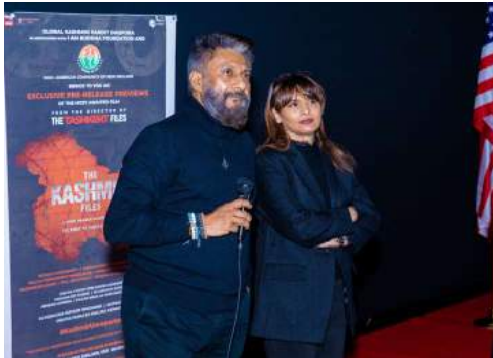
Vivek Agnihotri and Pallavi Joshi at Regal Cinema for the pre-release film screening.