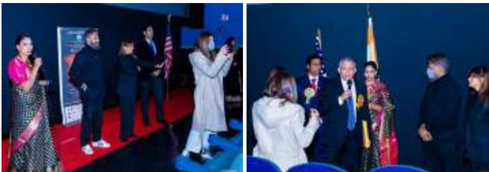
Meet and Greet with the guests.