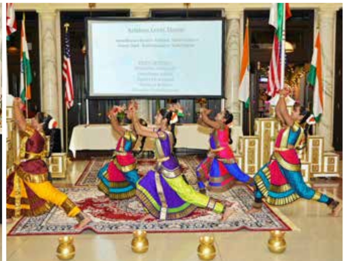
Amudhasri Dance School students performed at the occasion.