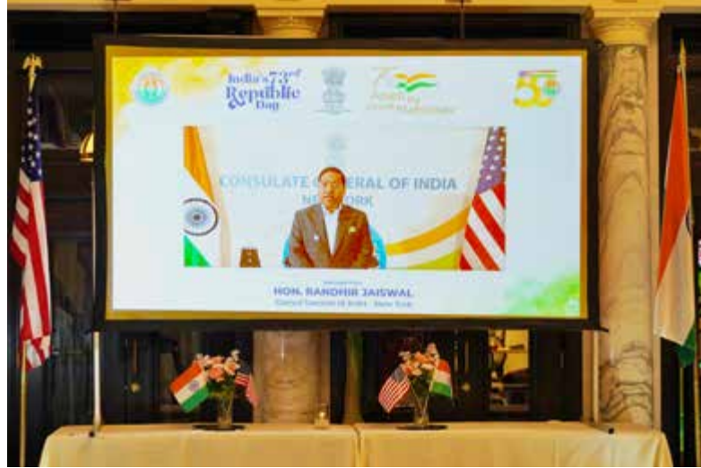
Video message from Consul General of India, New York Shri Randhir Jaiswal.