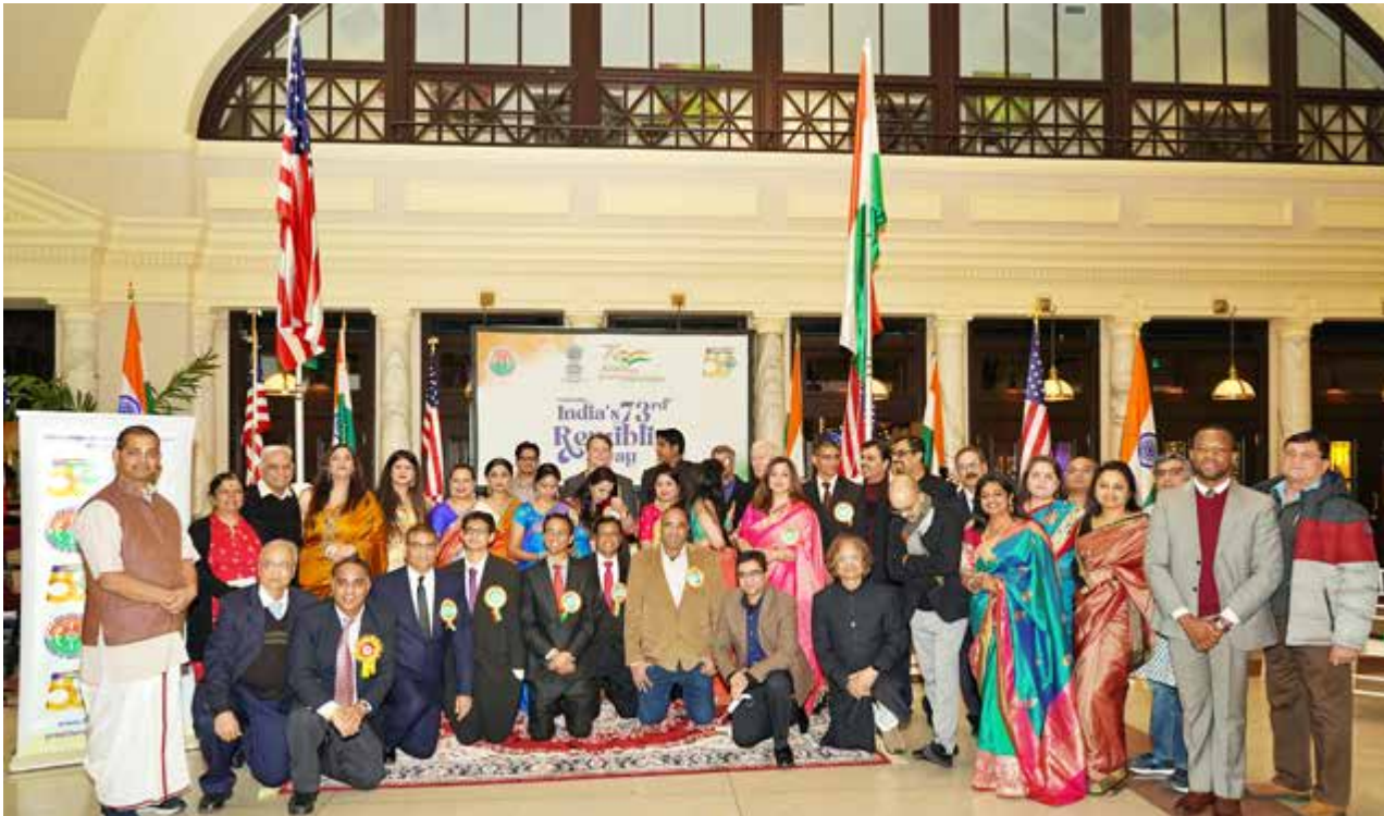
Team FIA-NE with Indo-American Community at India's 73rd Republic Day Celebration.