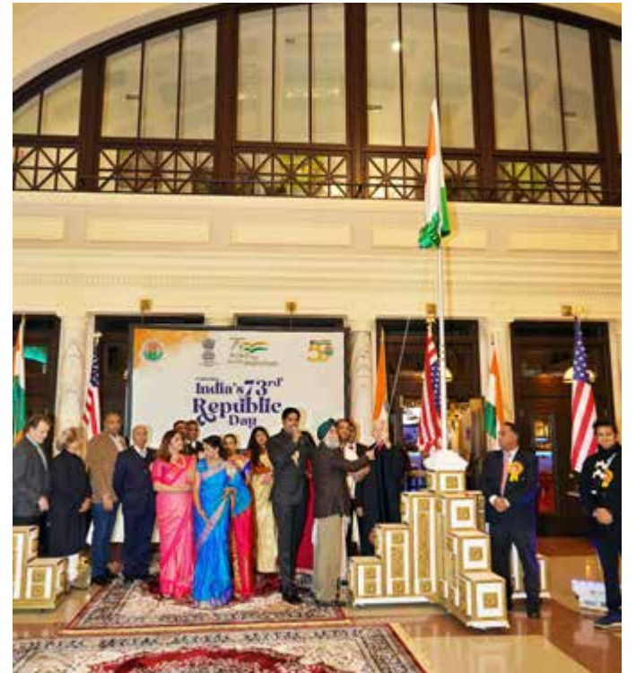
Flag hoisting at Grand Worcester, Union Station.