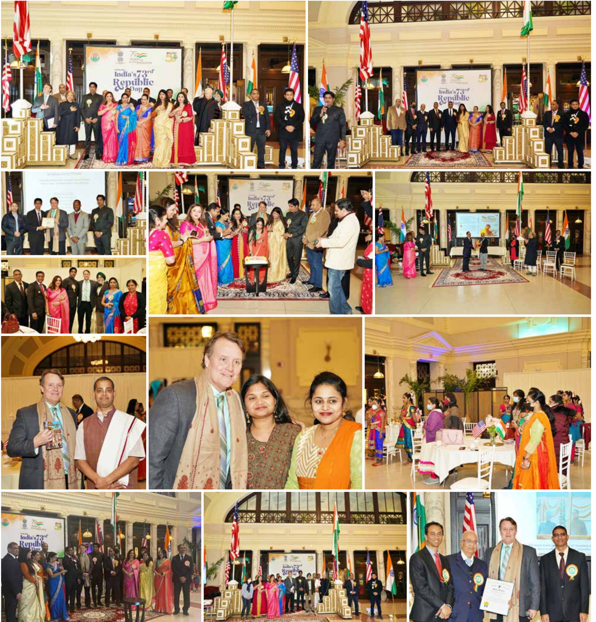
FIA -NE, imbued with great patriotic zeal and fervor, celebrated the 73rd Republic Day.

Thank You, Sponsors, Partner Organizations and Media Partners