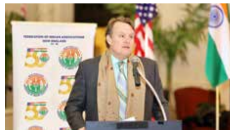
Senator Mike Moore addressing the event