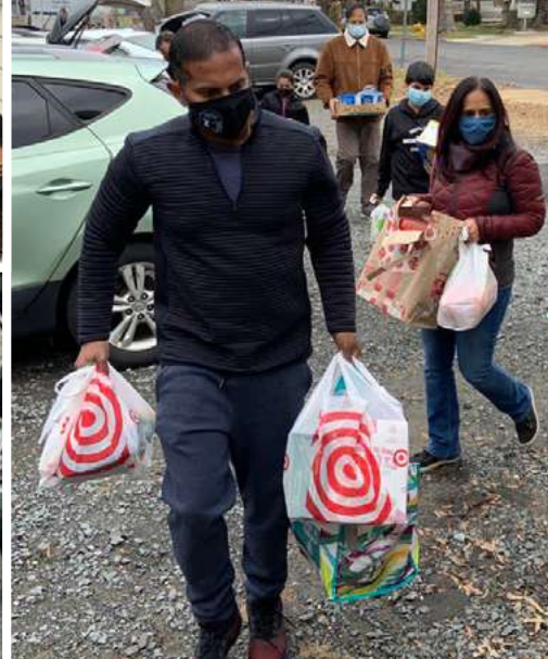
IFM Executive Committee Members, youth volunteers, and members of the Indian-American community.