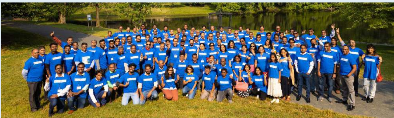
150 G. Pulla Reddy Engineering College (GPREC) alums convened for a memorable reunion

From the heartwarming opening rituals to the engaging business forum conclusion, the GPREC North America Alumni Meet 2023 was a treasure trove of old and new memories. It strengthened the bond within the alum community and set the stage for the GPREC family to reconnect, inspire, and be inspired.