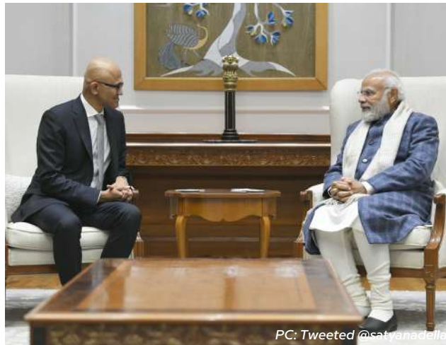
PC: Tweeted @satyanadella

"We shared that Google is investing $10 billion (roughly Rs. 81,980 crores) in the India digitization fund, and we are continuing to invest through that."