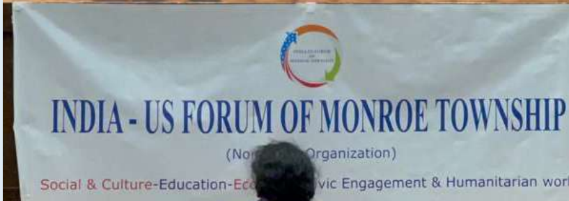
The IFM, NJ celebrated International Yoga Day at Monroe Township Senior Center