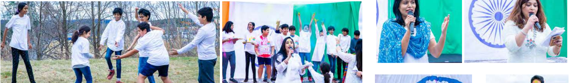
Children from the community danced and enjoyed the atmosphere.