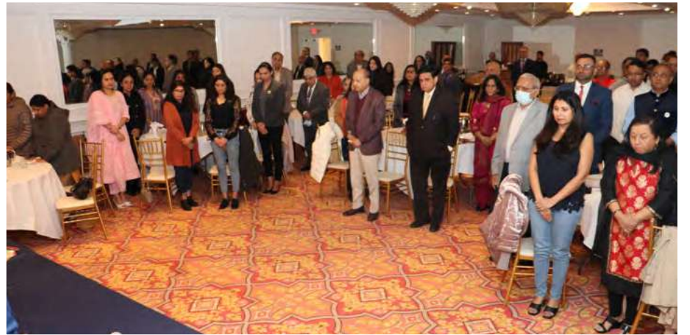
The meeting observed a one-minute silence for Shaheed Diwas in respect to the martyrs of the nation