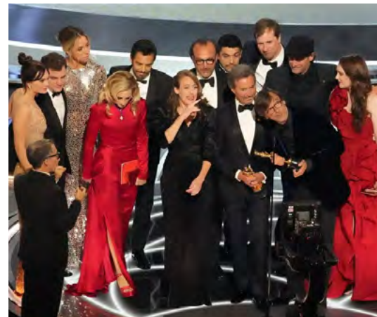
"CODA" won the Oscar for best picture

The winners of Oscars 2022: Best Film- CODA , Best Actor - Will Smith for King Richard , Best Actress - Jessica Chastain for The Eyes of Tammy Faye , Best director: The Power of the Dog - Jane Campion, Best original song: No Time To Die - No Time to Die ; Music and Lyric by Billie Eilish and Finneas O'Connell, Best animated feature: Encanto .