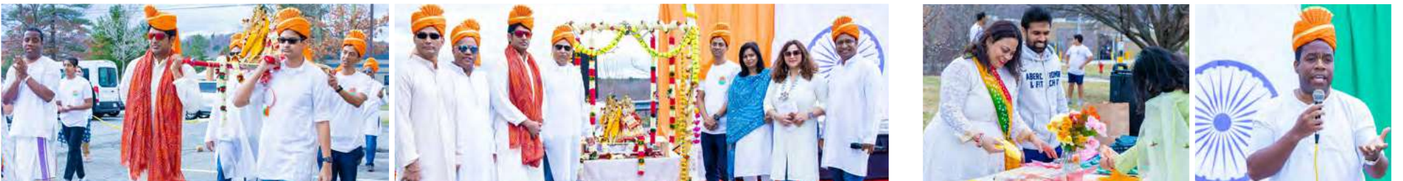
Radha Krishna idols were welcomed on the swing.