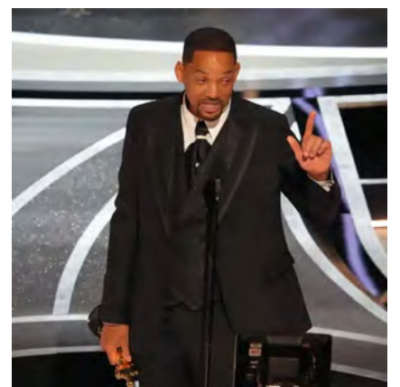
Will Smith won the best actor award