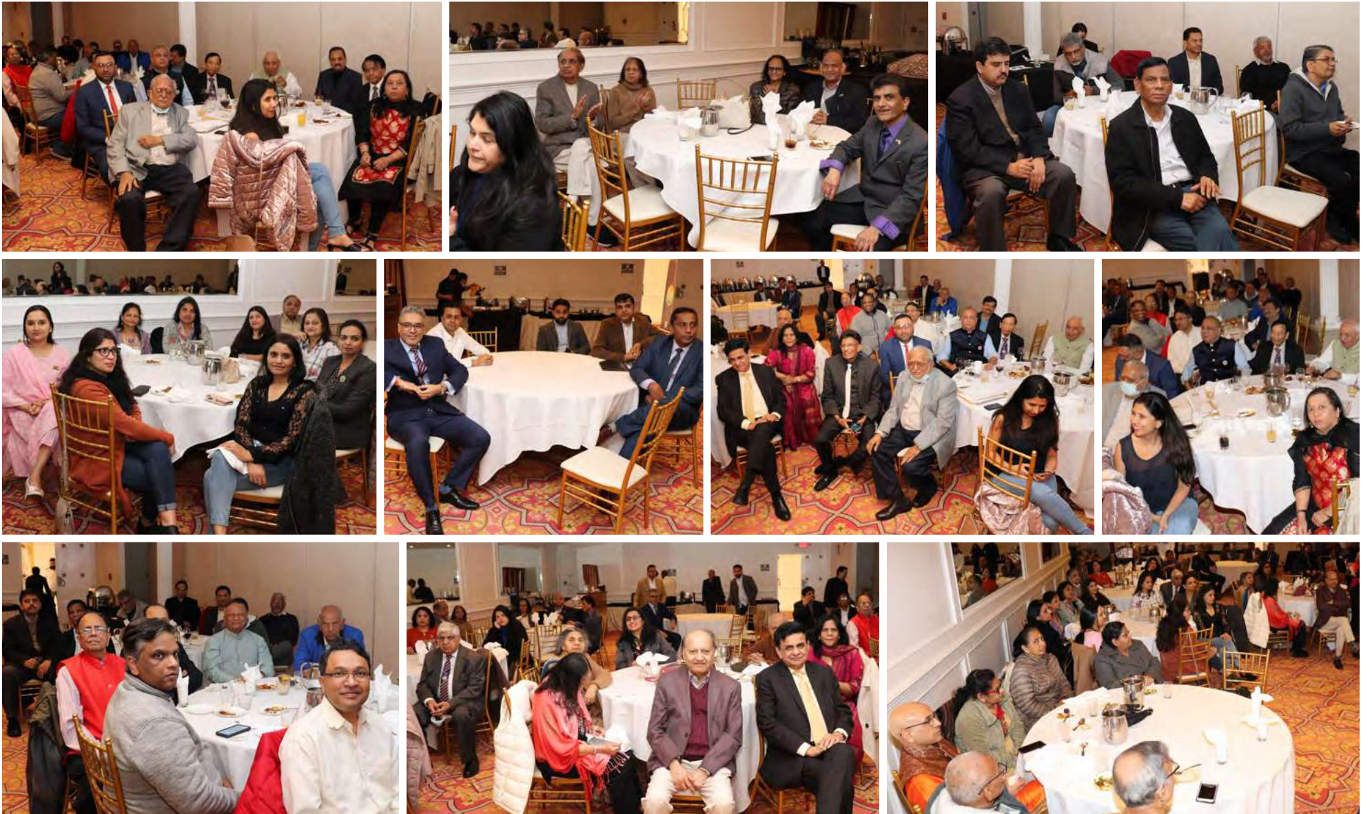
FIA Parade Council Meeting