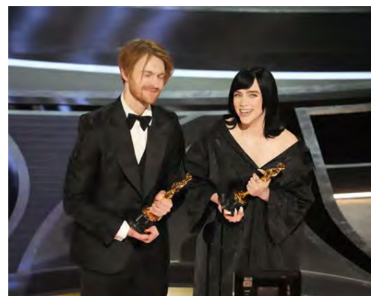
Billie Eilish and Finneas won the best original song award