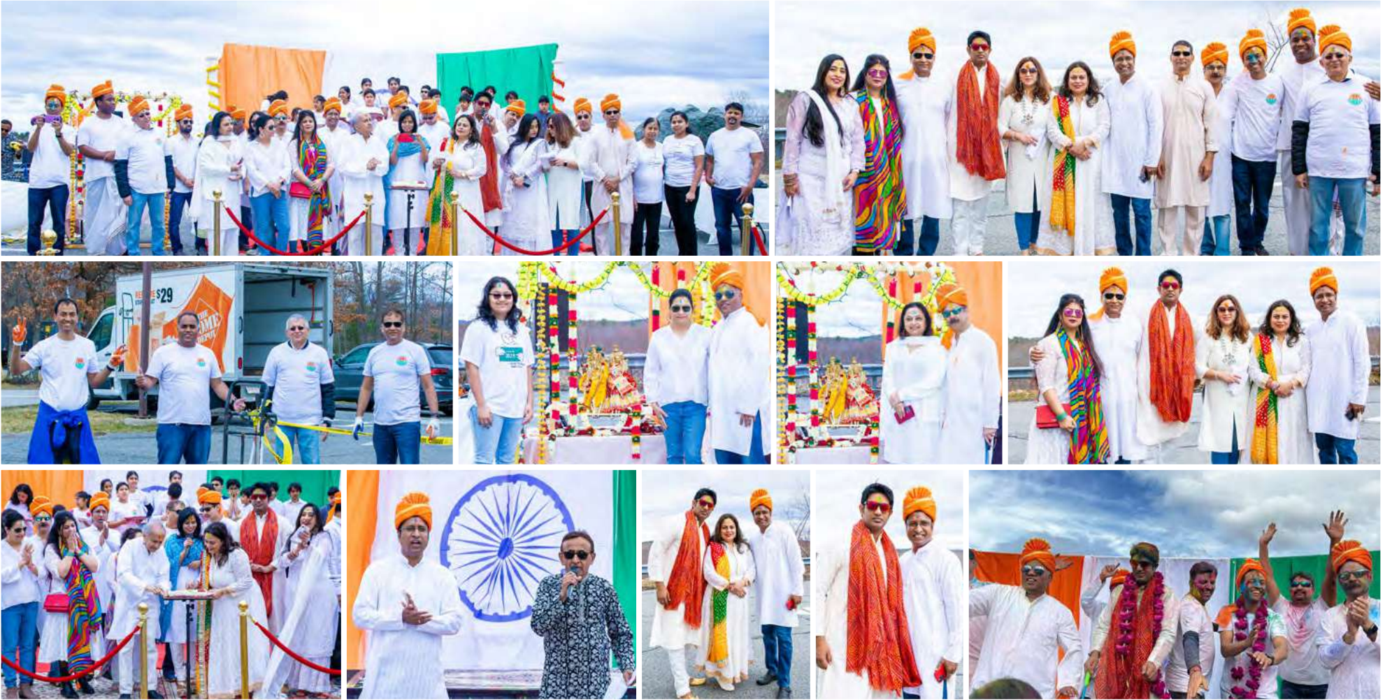
FIA-NE executive committee at the celebration of the Holi event.