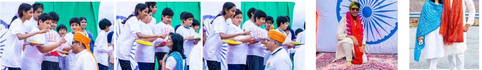
The children from the community welcomed all the FIA volunteers who helped put up a magnificent Holi event.