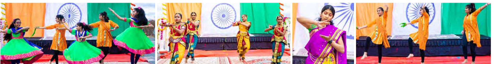
The celebrations witnessed some mesmerizing and full of energy dance performances.