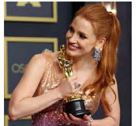
Jessica Chastain won the best actress award