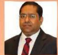
CHIEF GUEST SHRI RANDHIR JAISWAL CONSUL GENERAL OF INDIA IN NEW YORK.

PLEASE SPONSOR: SILVER $100 GOLD $250 PLATINUM $500 DIAMOND $1000