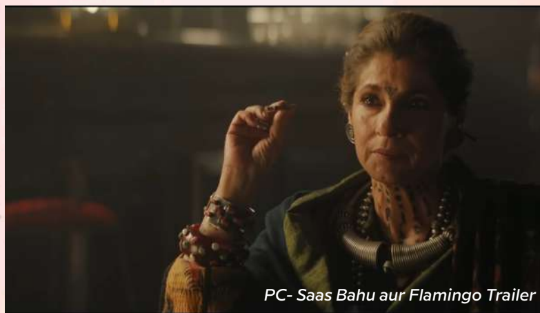
PC- Saas Bahu aur Flamingo Trailer