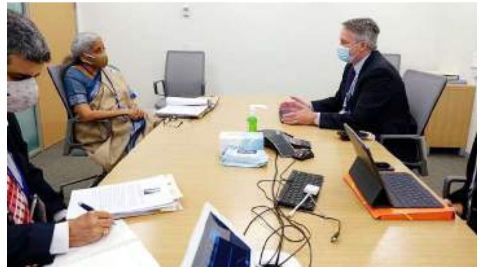
Nirmala Sitharaman meets with OECD Secretary-General Mathias Cormann.