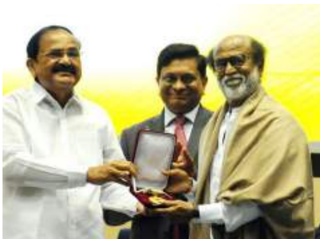
Rajinikanth receiving Dadasaheb Phalke Award

6 7th National Film Award ceremony was held on Oct 25 at Vigyan Bhawan, Delhi. Manoj Bajpayee received the Best Actor award for “Bhonsle” and Dhanush received the Best Actor award for “Asuran.” Kangana Ranaut was honored with the Best Actress award for her performance in “Manikarnika: The Queen of Jhansi” and “Panga.”