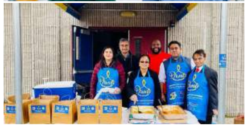
Trenton Soup Kitchen and Soup Kitchen in Norwalk