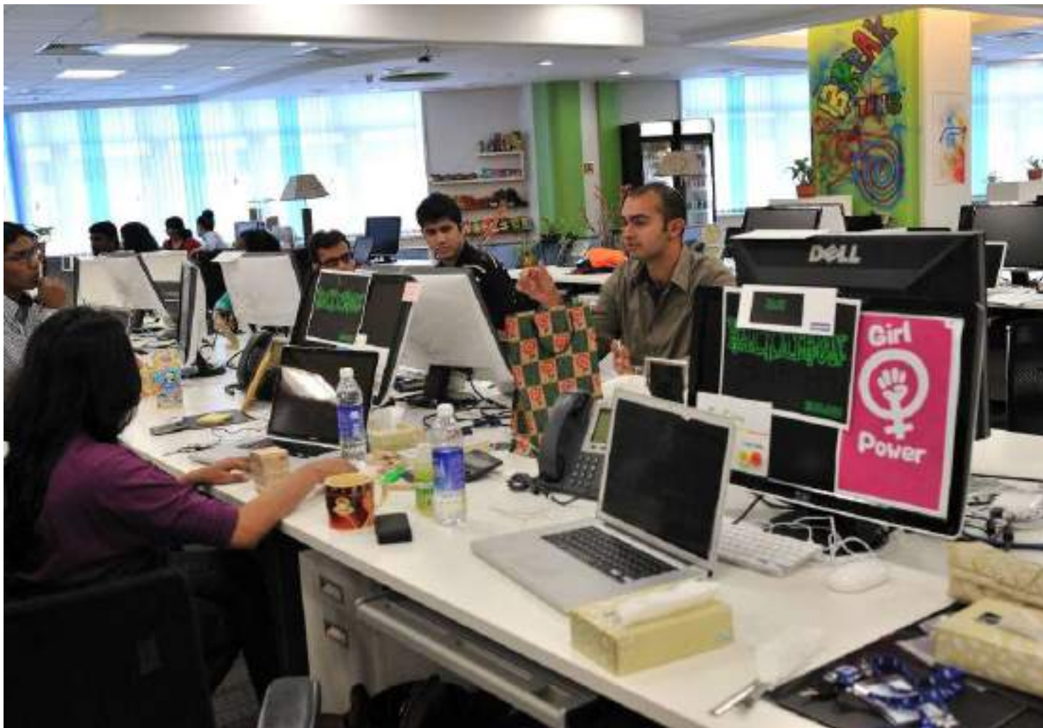
File photo of Indian and American employees working out of the Facebook offices in Hyderabad, India, Dec. 1, 2010.

A $4.75 million fine and $9.5 million in back compensation are insignificant for a firm worth $1 trillion with roughly $86 billion in revenue last year. However, the news comes at a moment when Facebook is under increasing public scrutiny.