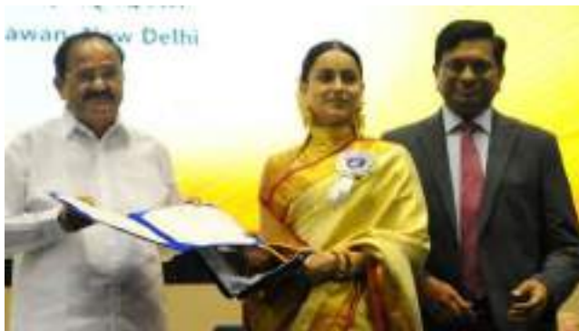
Actress Kangana Ranaut receiving the Best Actress award from Vice President Venkaiah Naidu.