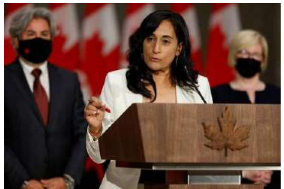
Ms. Anand, during a press conference after swearing-in of a new cabinet.

Prime Minister also quoted in the news that "We have a team of familiar faces and new faces that are ready to put all their strengths, all their hard work towards delivering for Canadians in the coming years."