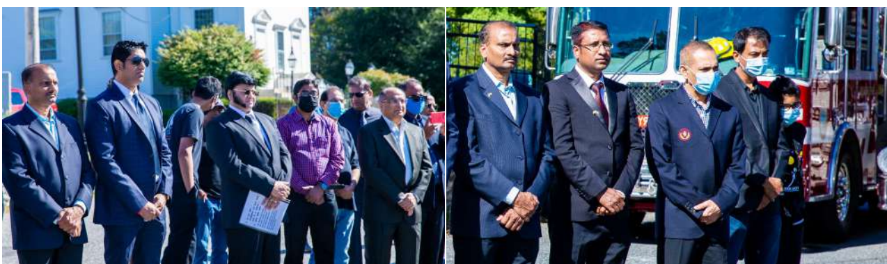
Indian American Community mourns as leaders and families mark 20th anniversary of 9/11 attacks