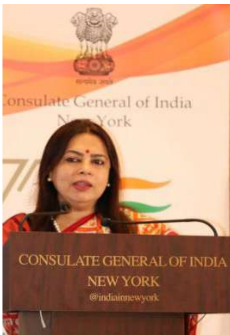
Minister of State for External Affairs Meenakshi Lekhi addressing members of the Indian community in New York Twitter @IndiainNewYork