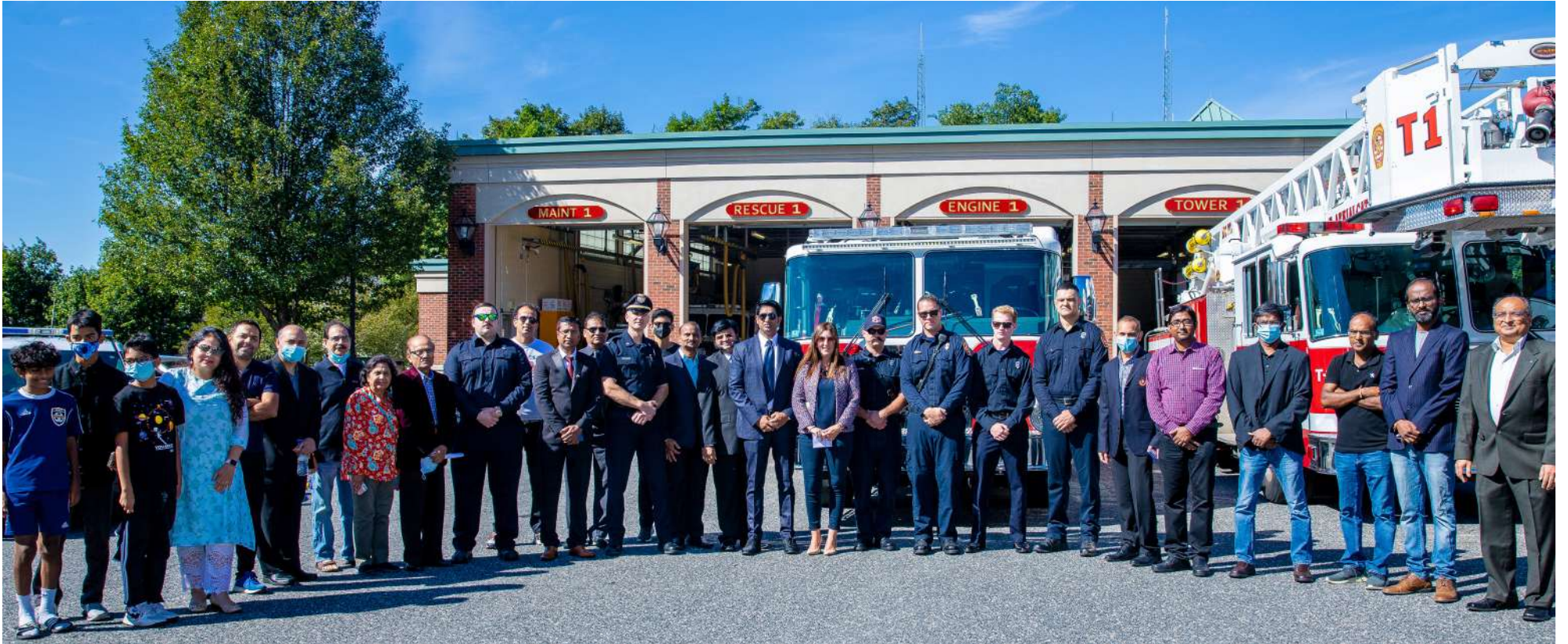
Several members of the FIA and Indian American community of New England gathered for Moment of Silence in the remembrance of 9/11 deceased

F ederation of Indian Association (FIA) and Indo-American Community of New England region joined with Shrewsbury, MA Fire Department in their 20th anniversary of the Sept. 11 terrorist attacks remembrance ceremony held on Saturday, September 11, 2021, at the Shrewsbury Fire headquarters. Several community leaders along with a number of the public attended the event and showed their heartfelt support.