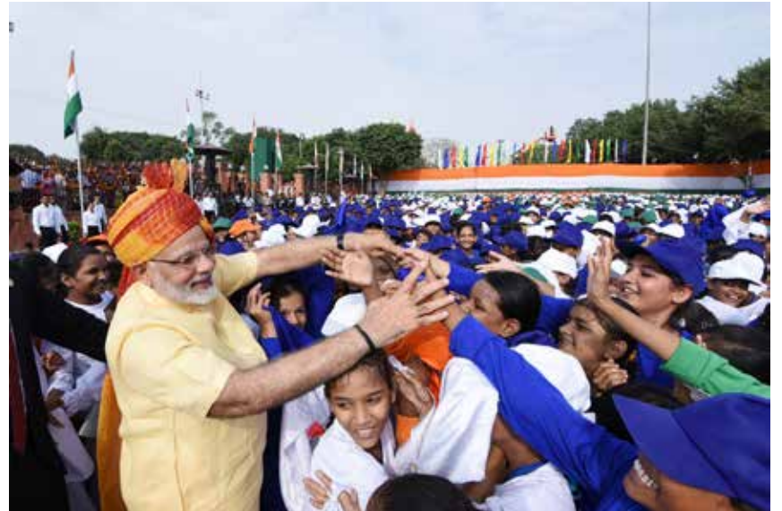
Modi interacts with school children after delivering his address on Independence Day in New Delhi, Aug. 15, 2017.

India's popular and visionary prime minister, Shri Narendrabhai Modi, will turn 70 on September 17, 2020. Born in Vadnagar, Gujarat on Sept. 17, 1950, Narendra Damodardas Modi has come a long way from an ordinary chaiwala to the country's prime minister. Prime Minister Modi's success saga is a story of determination, dedication, hard work, multiple talents and support of the people for all his political endeavors.