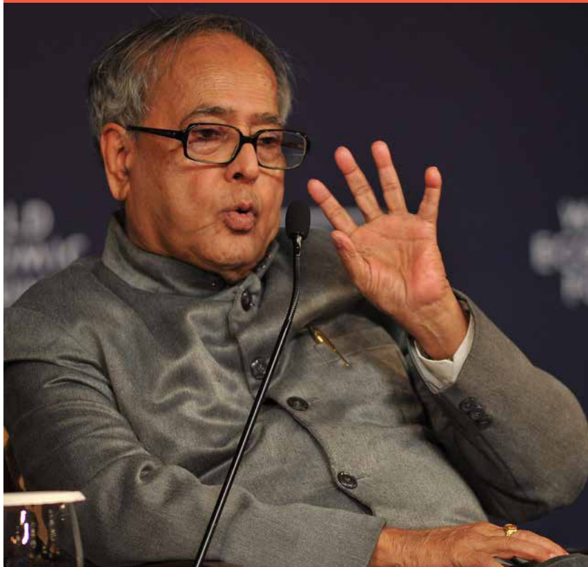
Then Finance Minister Pranab Mukherjee during the World Economic Summit 2009 in New Delhi.

in the Rajya Sabha from 1980 to 1985. Later, he was Deputy Chairman of the Planning Commission from 1991 to 1996; Minister for Commerce from 1993 to 1995; Minister of External Affairs from 1995 to 1996; Minister of Defense from 2004 to 2006 and once again the Minister of External Affairs from 2006 to 2009. He was the Minister of Finance from 2009 to 2012 and Leader of the Lok Sabha from 2004 to 2012 till he resigned to contest election to the office of the president.