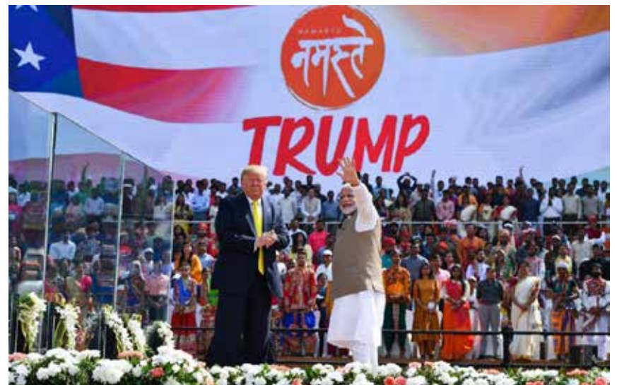
Modi with President Donald Trump at the 'Namaste Trump' rally in Ahmedabad, Feb, 24, 2020.