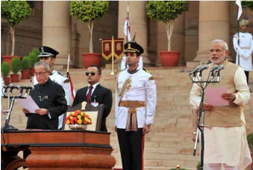
Narendra Modi takes the oath of office as the Prime Minister of India, with President Pranab Mukherjee administering the oath.