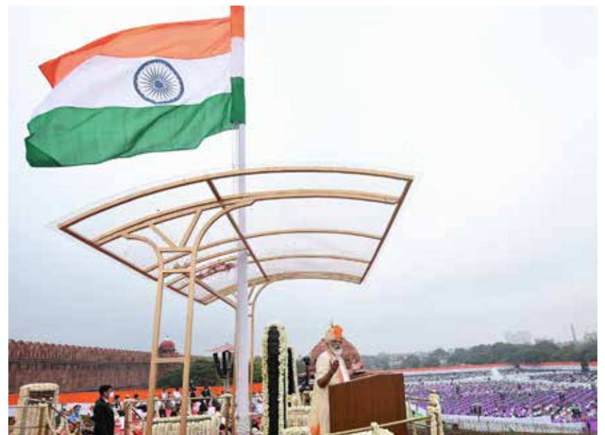
Prime Minister Narendra Modi addresses the nation on the occasion of the 74th Independence Day, Aug. 15, 2020.

His 100-year-old mother, Hiraba, is a great source of inspiration and blessings to him.