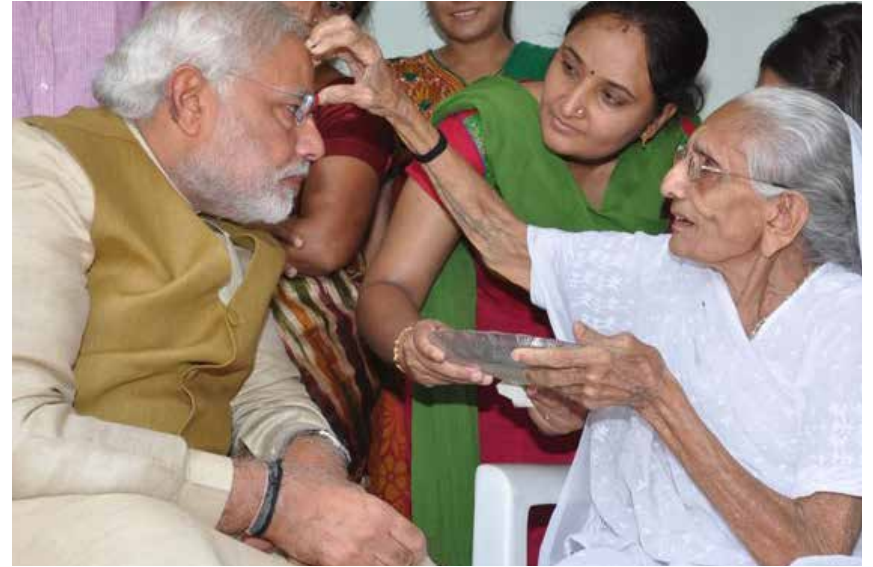
Modi meets his mother after winning the 2014 elections.

Modiji is very pious, honest and truly patriotic in nature. He is a great orator and thinker and is blessed with an incredible talent of creative writing and poetry and is a superb planner and executioner.