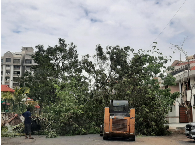
The cyclone uprooted several trees, like this one in Ahmedabad

Last week, Cyclone Tauktae hit India, badly affecting the western coast of the country. Gujarat was the worst-hit. In fact, Tauktae was only the second cyclone of 'extremely severe' category to hit the state in 23 years.