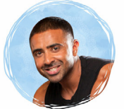
JAY SEAN Singer, Songwriter