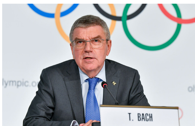
IOC president Thomas Bach