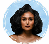
NINA DAVULURI American Public Speaker, Actor