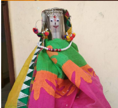
(Above) The spread for Vishu kani. (Left) A decorated pole on Gudi Padwa

Gangaur will be celebrated on April 15 in central and western India, mainly Rajasthan. The festival is celebrated by women who pray to Goddess Parvati for a bountiful spring.