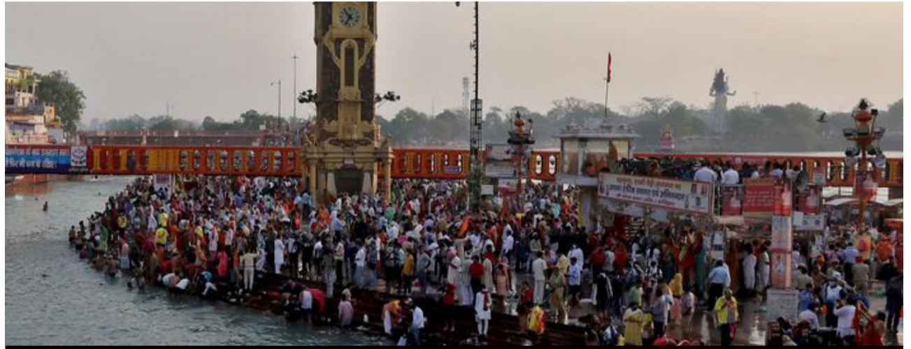
People have become lax in following Covid-appropriate behavior, said Dr Randeep Guleria

Until mid-March, the number of new infections in the country was around 12,500 to 25,000 a day. But by the end of the month, there was a sudden spike, with India reaching the point where it reports the highest number of new cases. The impact has been aggravated by lack of adherence to Covid-appropriate safety protocols and the circulation of highly