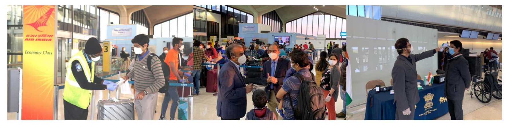
Passengers check-in at the Newark Liberty International Airport in New Jersey for the May 10 flight to Mumbai and Ahmedabad.