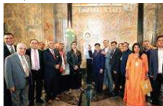
The Indian Diaspora in the U.S. celebrates India's Independence day.