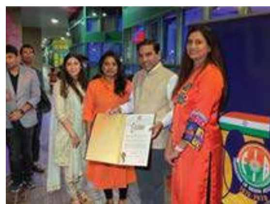
FIA had the honor of hosting community welcome and farewell for Indian diplomats for the last 20 years