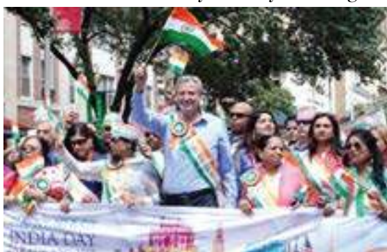
NYC Mayor Bill de Blasio has graced India Day Parades during his term.