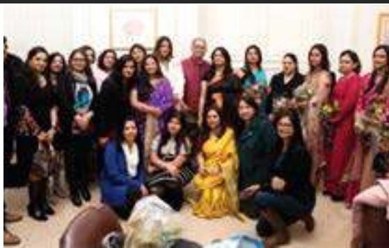
Women's Empowerment seminar on International Women's Day, March 8, organized jointly with the Indian Consulate in New York