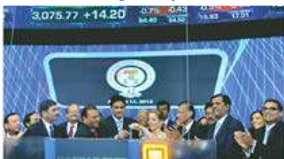
NASDAQ opening & closing bell ceremonies to commemorate India's Independence Day