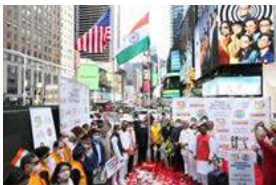
FIA NY-NJ-CT created history on August 15, by unfurling the Indian tricolor for the first time ever at Times Square in New York City, to commemorate India's 74th Independence Day.