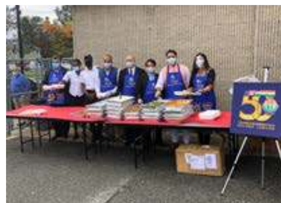
FIA shined through the pandemic with its philanthropic efforts with more than 10,000 meals served for community assistance.