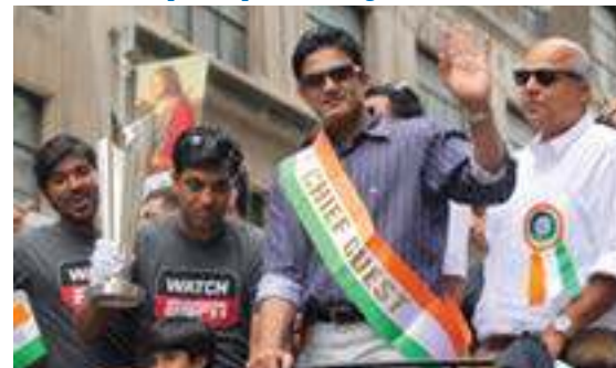
Cricketer Anil Kumble graces the 32nd India Day Parade as chief guest.