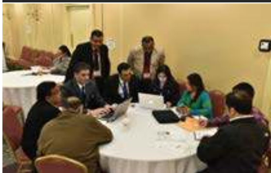
Community Assistance Program with the Consulate General of India in New York nearly a decade of serving the community