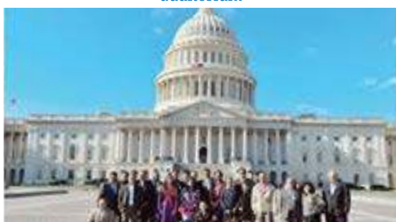
More than 400 Indian-Americans attend India Day on Capital Hill