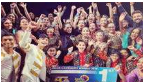
FIA has been commemorating India's Republic Day for the last few decades annually, with Dance Pe Chance where 700 children participate in a 2000 capacity auditorium