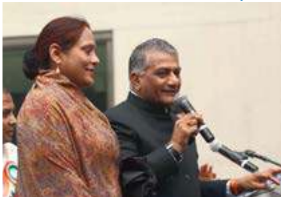
Indian chief of Army staff Gen. V. K. Singh(Retd.) addressing India Day Parade.