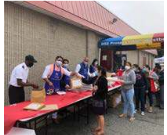
Diwali soup kitchen in Westbury, New York.