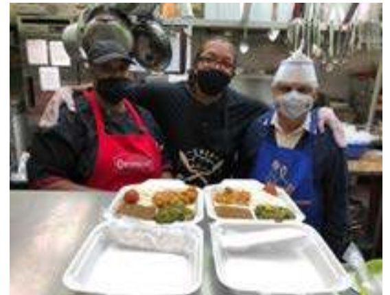
Diwali soup kitchen Norwalk, Connecticut.

EDISON, New Jersey: The Federation of Indian Associations of NY, NJ, CT, officially launched its very first "Diwali Soup Kitchen - Spreading Lights of Happiness." The FIA initiative is a complimentary meal provision to tri-state recognized soup kitchens who serve meals to those in need.