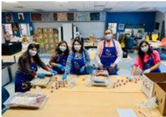
Trenton Soup Kitchen in New Jersey