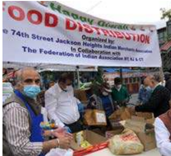
Eva’s Kitchen in Paterson, New Jersey.