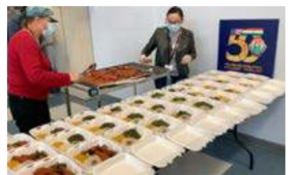
Eva's Kitchen in Paterson, New Jersey.

Voluntary Content Compilation FIA NY-NJ-CT and Community Volunteers