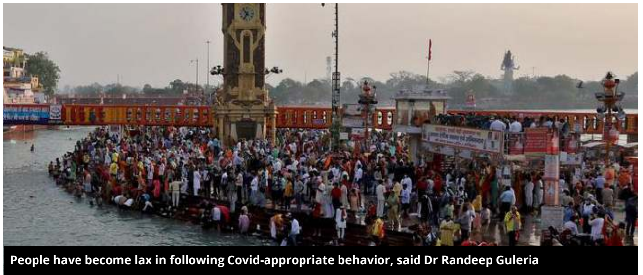
People have become lax in following Covid-appropriate behavior, said Dr Randeep Guleria

Until mid-March, the number of new infections in the country was around 12,500 to 25,000 a day. But by the end of the month, there was a sudden spike, with India reaching the point where it reports the highest number of new cases. The impact has been aggravated by lack of adherence to Covid-appropriate safety protocols and the circulation of highly