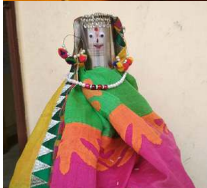
(Above) The spread for Vishu kani. (Left) A decorated pole on Gudi Padwa

Gangaur will be celebrated on April 15 in central and western India, mainly Rajasthan. The festival is celebrated by women who pray to Goddess Parvati for a bountiful spring.