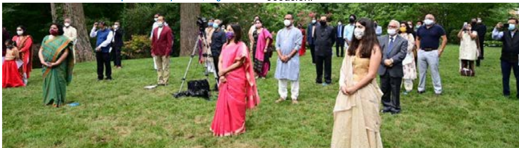
Guests maintain social distance at the event at the Embassy of India in Washington, D.C., to commemorate the 74th Independence Day of India, August 15.

The 74th Independence Day of India was celebrated in Washington D.C. with a flag-hoisting ceremony on Aug. 15 at the India House. Members of the Indian community joined the celebrations in large numbers virtually through digital platforms in view of local public health guidelines.