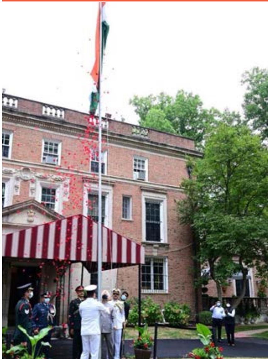
Hon. Taranjit Singh Sandhu, India's Ambassador to the U.S., unfurls India's national flag at an event at the Embassy of India in Washington, D.C., to commemorate the 74th Independence Day of India, August 15.