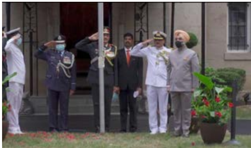
Hon. Taranjit Singh Sandhu, India's Ambassador to the U.S., with his staff at the event at the Embassy of India in Washington, D.C., to commemorate the 74th Independence Day of India, August 15.