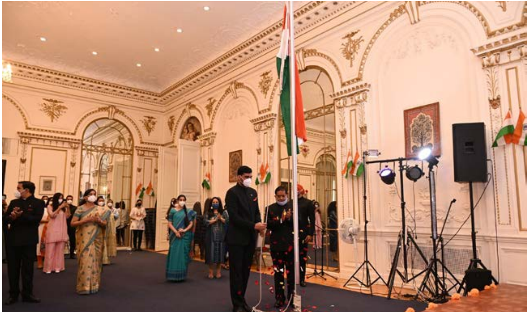
Hon. Consul General of India in New York, Randhir Jaiswal, unfurls India's national flag at an event at the Consulate to commemorate the 74th Independence Day of India in New York, August 15.