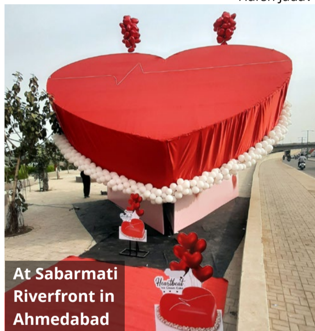
At Sabarmati Riverfront in Ahmedabad

As for other gifts, there is no limit to what is spent of a V-Day gift. World over, V-Day