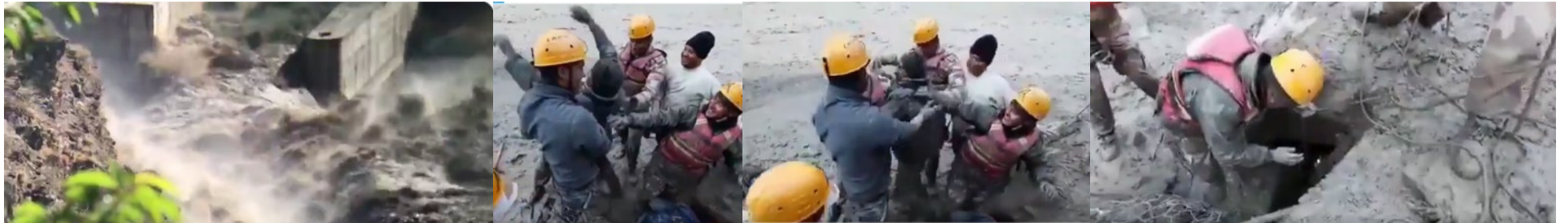
(L-R) The flood that took many unawares; rescuers pull out a man from the tunnel; search on for more survivors

Post-mortem indicates that those who died in the massive flooding caused by the bursting of a glacier on February 7 had little time to escape; police continue to dig out bodies from the Tapovan tunnel where many were trapped