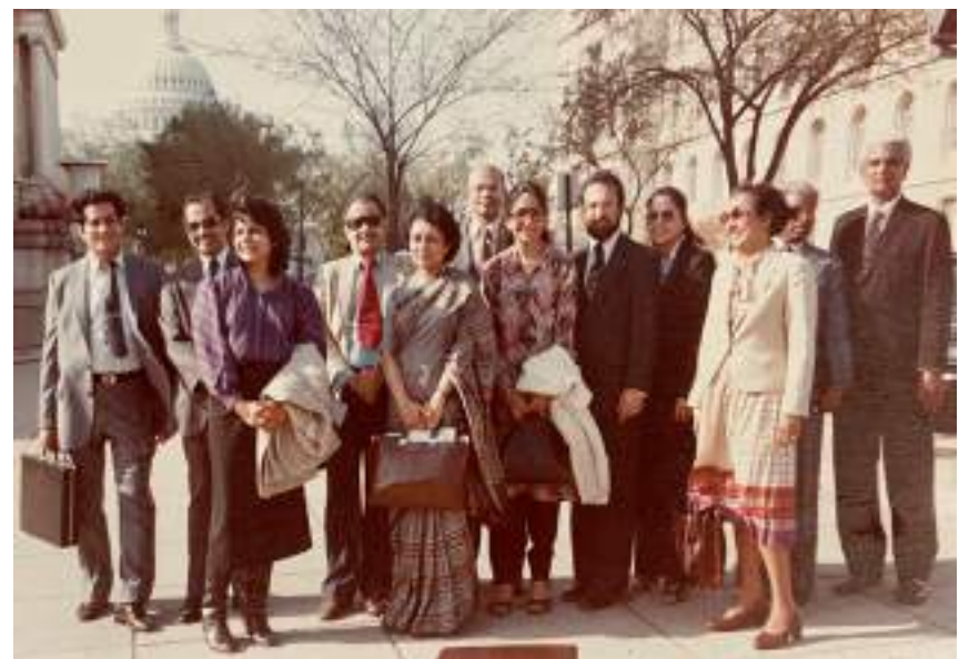
FIA delegation in Washington, D.C.