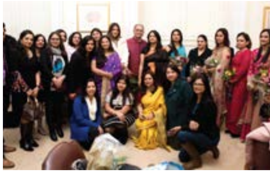
Women's Empowerment seminar on International Women's Day, March 8, organized jointly with the Indian Consulate in New York