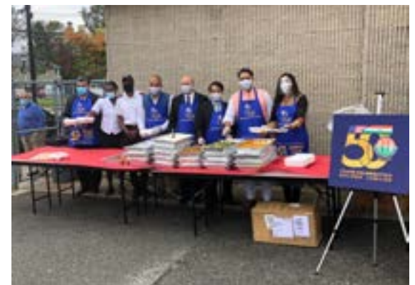
FIA shined through the pandemic with its philanthropic efforts with more than 10,000 meals served for community assistance.