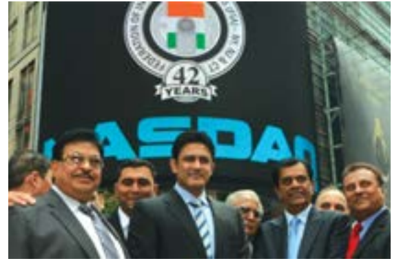
NASDAQ opening ceremonies to commemorate India's Independence Day

While facing the dire impact of the pandemic, including on its fundraising activities, FIA has continued with the challenges faced, to serve and uplift the community in these unprecedented times. Among the unique initiatives introduced during the challenging year were assistance to first responders which included serving meals in local hospitals and to NYPD, including front line heroes, hot meals in the International Diwali Soup Kitchen Drive in the U.S. and India; Bi-Weekly Diaspora newsletter which will complete one year in January 2021; historic flag hoisting ceremony at Times Square on India's Independence Day, accommodation assistance in partnership with the Consulate General of India in New York to find accommodations for the students from India who were stranded in the U.S. due to COVID-19 travel ban; OCI & visa Town Hall; and several other events on the hybrid as well as exclusively virtual platforms. For its work during the pandemic, the FIA, along with its core members, was recognized as COVID Heroes by Brooklyn Borough President, Hon. Eric Adams.