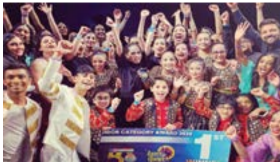
FIA has been commemorating India's Republic Day for the last few decades annually, with Dance Pe Chance where 700 children participate in a 2000 capacity auditorium