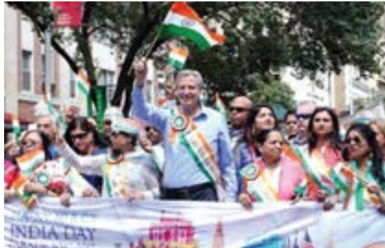
NYC Mayor Bill de Blasio has graced India Day Parades during his term.