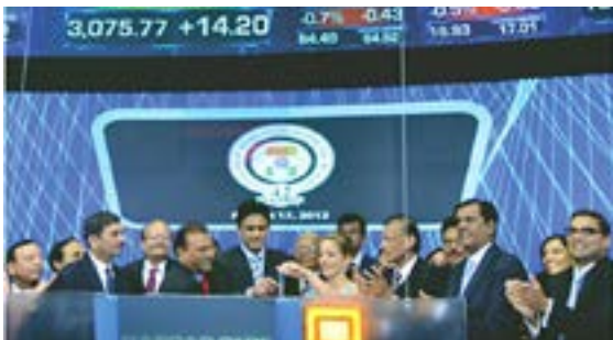
NASDAQ opening & closing bell ceremonies to commemorate India's Independence Day