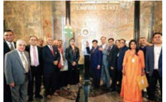
The Indian Diaspora in the U.S. celebrates India's Independence day.