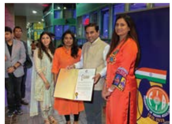
FIA had the honor of hosting community welcome and farewell for Indian diplomats for the last 20 years