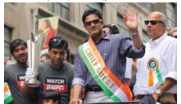
Cricketer Anil Kumble graces the 32nd India Day Parade as chief guest.