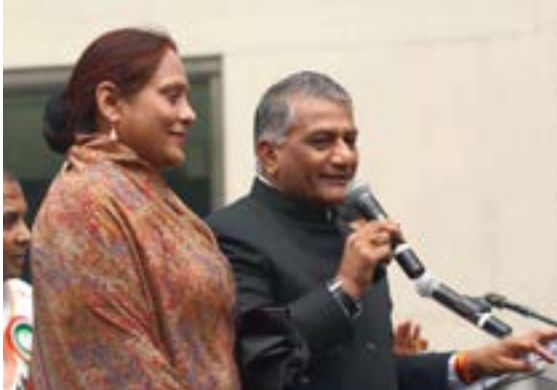
Indian chief of Army staff Gen. V. K. Singh(Retd.) addressing India Day Parade.