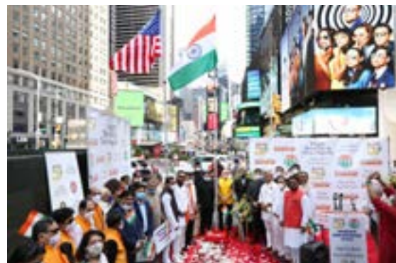
FIA NY-NJ-CT created history on August 15, by unfurling the Indian tricolor for the first time ever at Times Square in New York City, to commemorate India's 74th Independence Day.