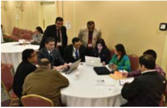
Community Assistance Program with the Consulate General of India in New York nearly a decade of serving the community