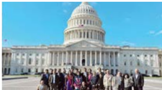
More than 400 Indian-Americans attend India Day on Capital Hill