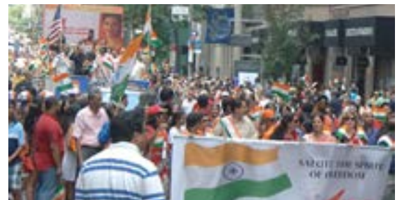
Air India - The pride of India in the skies has supported the parade since its inception in 1981 and participates with grandeur.